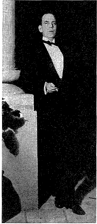
Addison Mizner (left) and Wilson Mizner (right) at the gala opening of the Cloister Inn on February 6, 1926.

Addison and Wilson did not take long to squander the deal of their lifetimes. 12