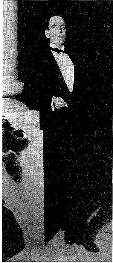
Addison Mizner (left) and Wilson Mizner (right) at the gala opening of the Cloister Inn on February 6, 1926.

Addison and Wilson did not take long to squander the deal of their lifetimes. 12